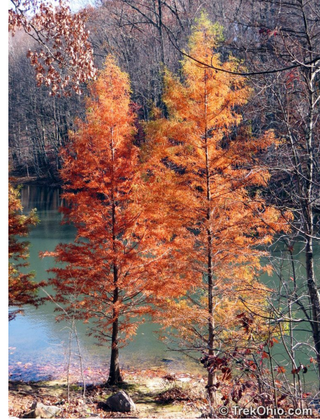
Bald Cypress ( Taxodium distichum )