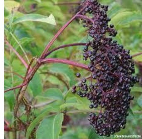
American Elder ( Sambucus canadensis )